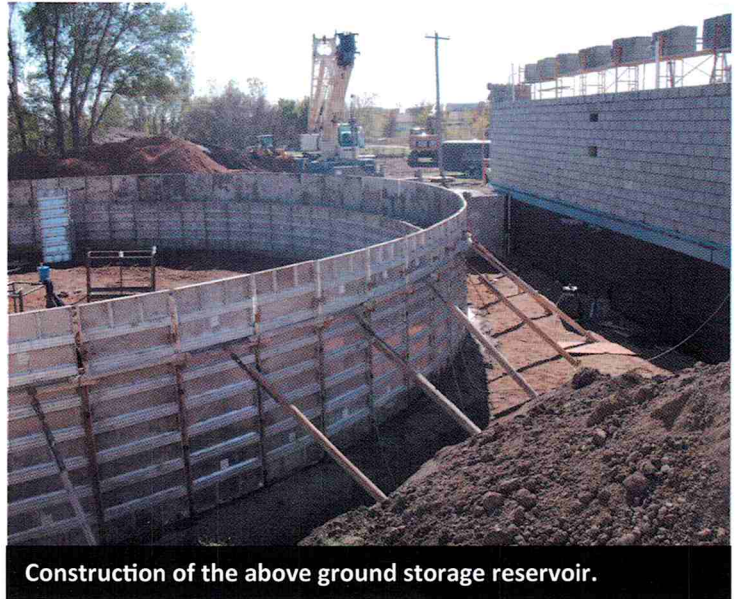
Construction of the above ground storage reservoir.

Focus will shift inside this winter to the replacement of the Water Treatment Plant's four